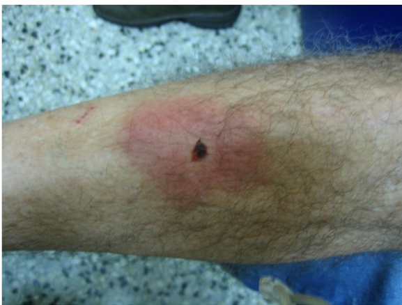
Figure 3. Male patient that suffered an intra-domiciliary bite, while he was trying to capture a bat. He sought medical attention; the bat species was identified as Desmodus rotundus . The bat was negative for RABV; however, the patient received post exposure prophylaxis.

During December 2006, 23 cases of jungle rabies were recorded in human patients from Peru where a variant of the bat rabies virus was identified in deceased patients (Gomez-Benavides et al., 2007); a study later reported a seroprevalence rate of 10.3% in bats from Peru (Salmon-Mulanovich et al., 2009). A similar investigation was conducted on hematophagous bats in Mexico, finding antibody prevalence rates of 37% (Salas-Rojas et al., 2004) (Figure 1).