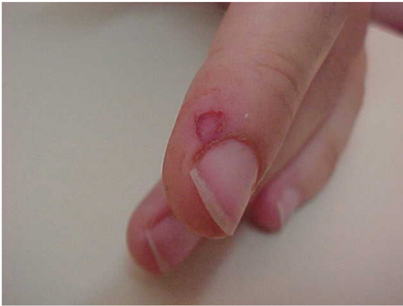
Figure 2. Biology researcher who suffered a Desmodus rotundus bite during a field work trapping bats in Venezuela. The bat resulted positive for RABV; however, the patient received prophylaxis post exposure and did not develop clinical disease.