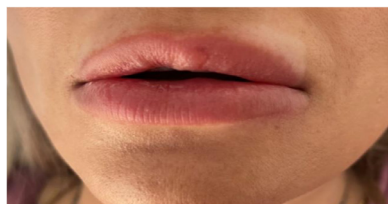
Figure 2. Result after 5 days using methylprednisolone [Au24].

tous nodules were visible on both the upper and lower lip with mild pain were visible from day 2 post-vaccine. These nodules disappeared completely in 7 days with no medical intervention. On February 11, 2021 the patient proceeded with her second dose of the Pfizer vaccine. On April 13, 2021 the patient complained a mild tenderness on her upper lip and two days later a painful erythematous oedema was developed on both the upper and lower lip (Figure 1).